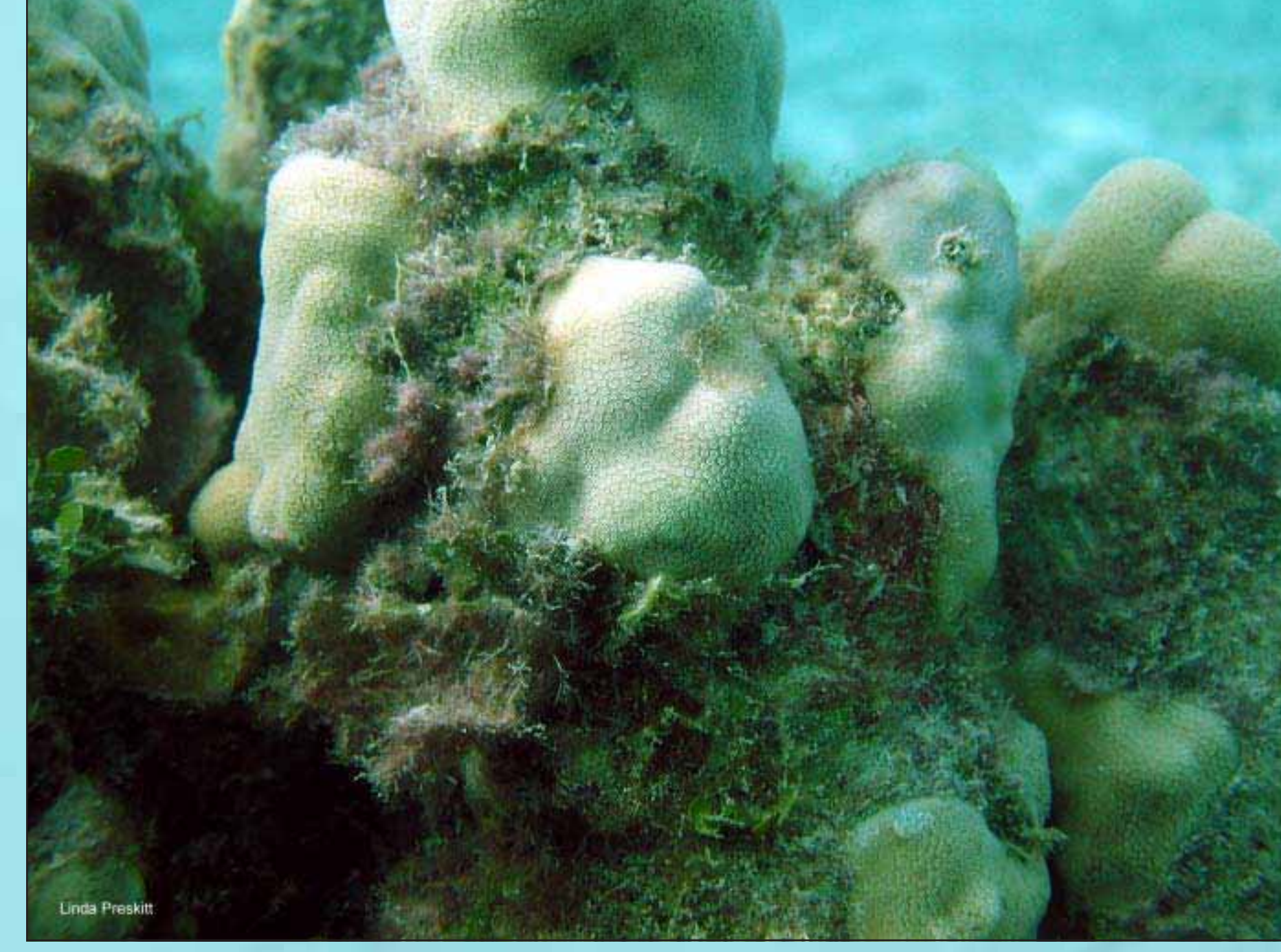
Diverse turf community on Porites compressa coral at French Frigate Shoals

The larger forms of turf present in the intertidal and reef flat regions cannot survive the herbivory at these deeper depths. Instead, the faster growing filamentous species with higher surface to volume ratios, such as Polysiphonia spp., Herposiphonia spp., and Ceramium spp., are more successful.